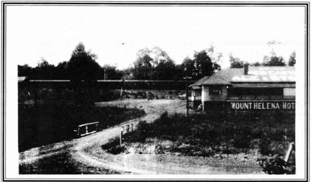
MT HELENA HOTEL AND TROOP TRAIN