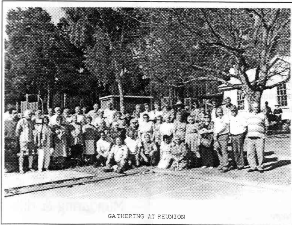
GATHERING AT REUNION