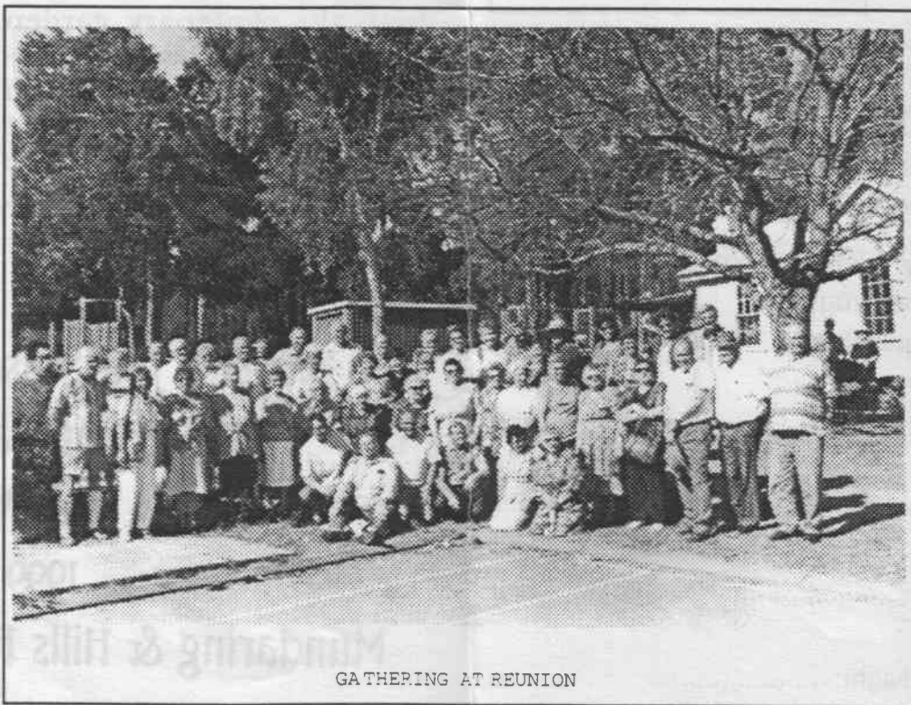
GATHERING AT REUNION