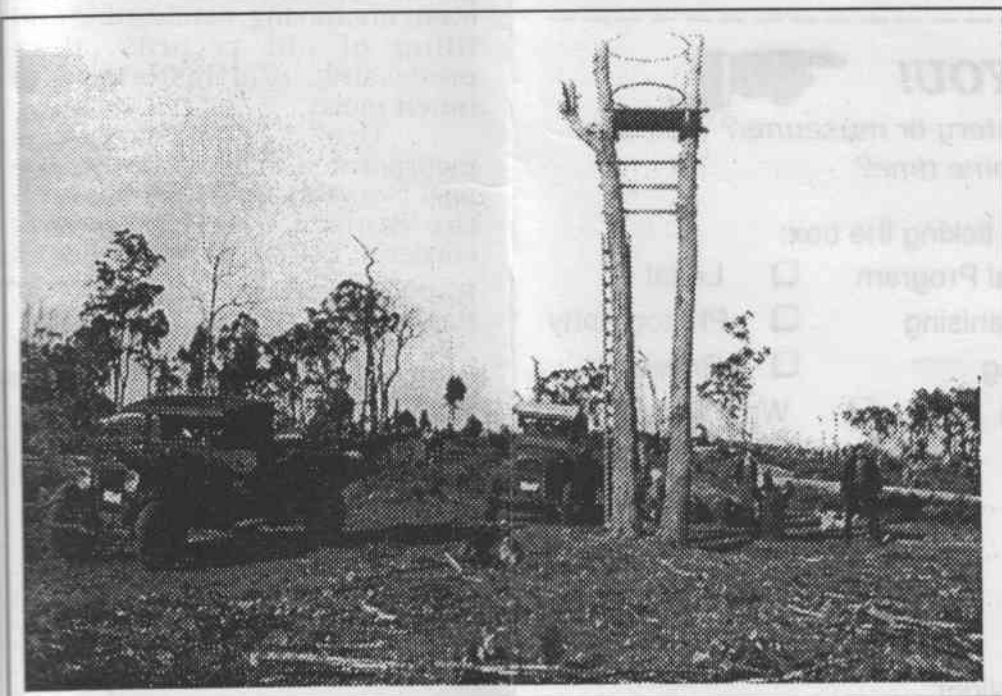
PADDY UNDERDOWN BUILDING THE FIRE WATCH TOWER, SAWYERS VALLEY, CIRCA 1930