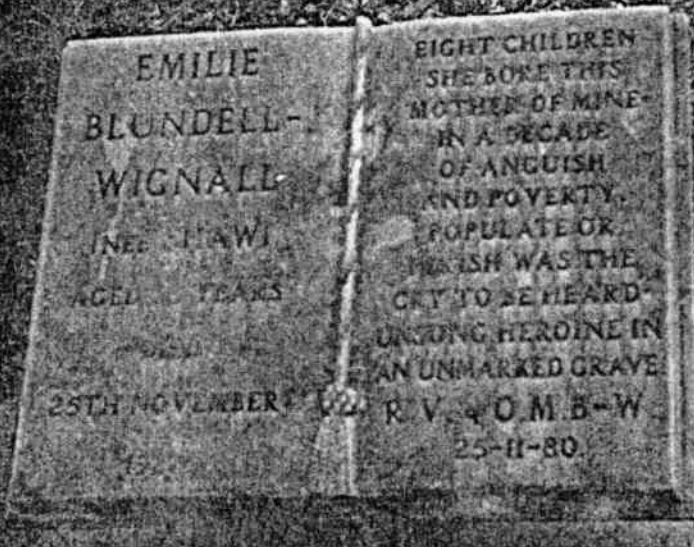
Grave Inscription - Wooroloo Cemetery