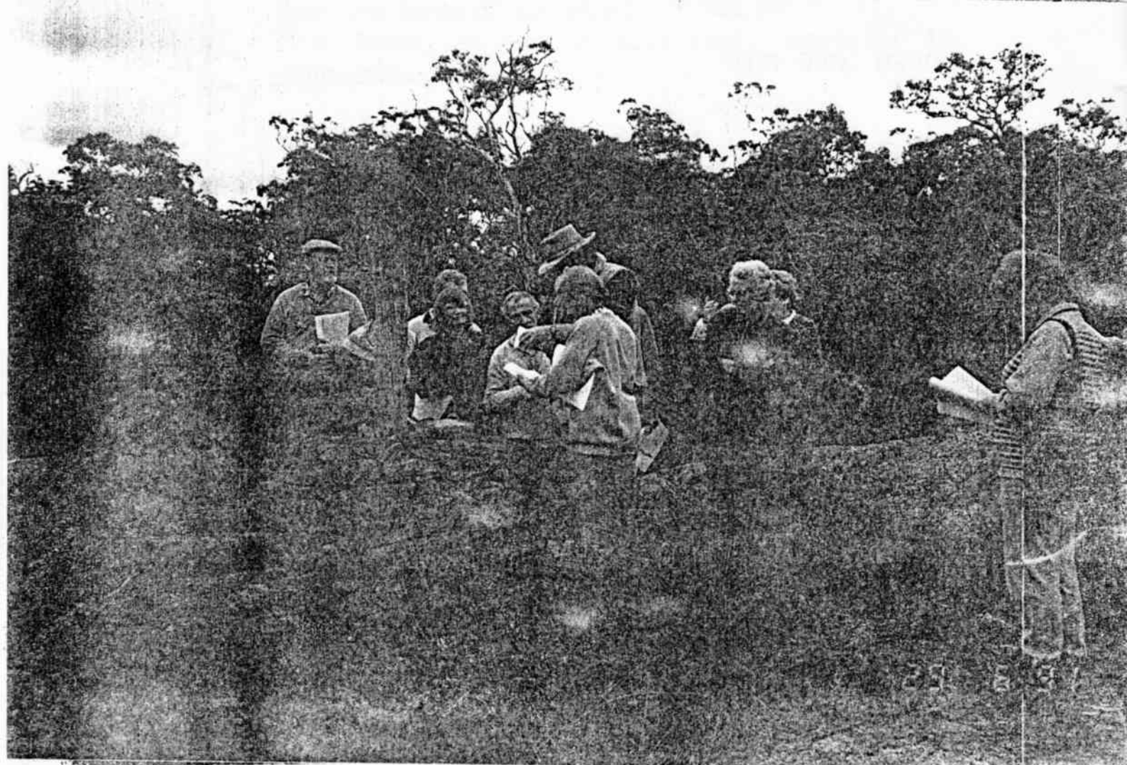
Historical Society members at Chauvey's